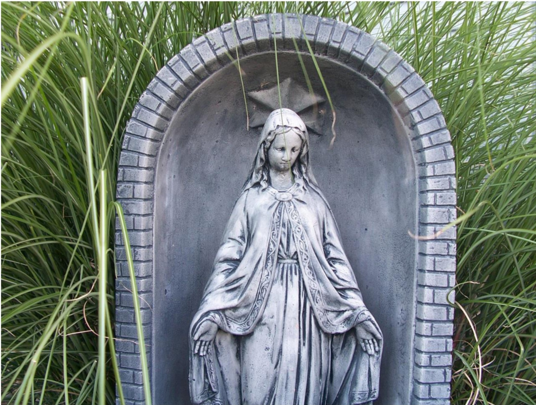
Our Lady Star of the Sea